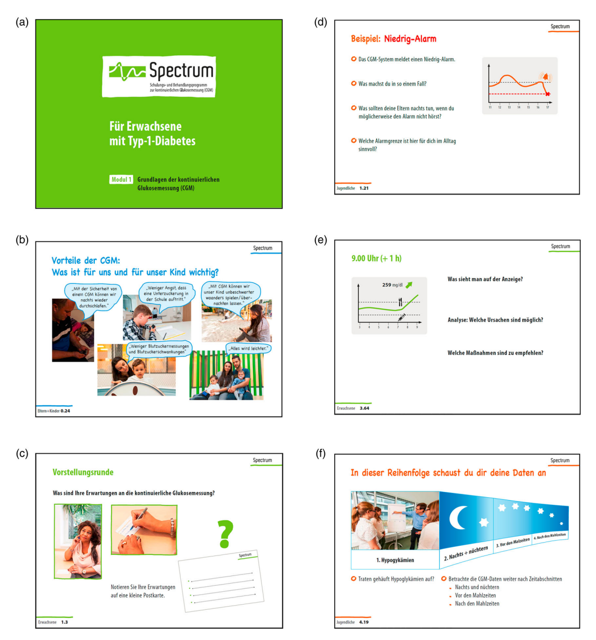
Figure 2 Examples of slides from the three versions of SPECTRUM for adults, for parents with young children and for adolescents with T1DM. Slide a: Opening slide of module 1 for adults. Slide b: Example of SPECTRUM for young kids and their parents. Possible advantages and challenges of CGM use are discussed prior to the decision on using CGM. Slide c: Patients are involved actively into the educational programme. In this example taken from the adult version of SPECTRUM the patients should note their personal expectations connected with CGM use on a special card. This card will be stored until the end of SPECTRUM by the diabetes team and then discussed again. Slide d: As strict product neutrality is crucial to achieve reimbursement of a patient educational programme in Germany, we developed a neutral CGM display. This example is taken from the adolescents' version of SPECTRUM and patients are asked to discuss the correct reaction to a low alarm. Slide e: This example is taken from the adult version of SPECTRUM and shows how patients are trained for interpreting their CGM display by discussing small 'real' cases. Patients are asked in a very structured way to describe what they see on the display, which causes may underlie and what the patient should do now in this situation. The next slides show the same case a few hours later (not shown). Slide f: The patients are suggested a structured way of interpreting CGM data (retrospective analysis) in four steps: Detect recurrent hypogly-caemia and assess glucose levels during night time, before and after meals. This algorithm is practiced with own CGM data during the training sessions.